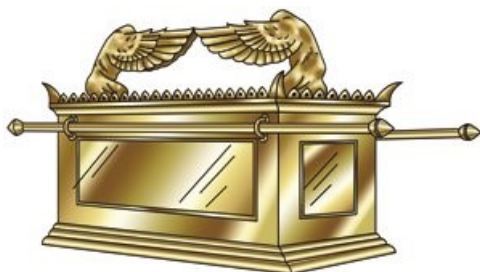
Ark of the Covenant

Joshua 6:6+ So Joshua the son of Nun called the priests and said to them, "Take up the ark of the covenant, and let seven priests carry seven trumpets of rams' horns before the ark of the LORD."